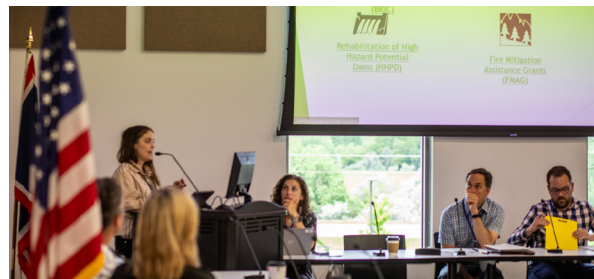
Wyoming Federal Funding Summit