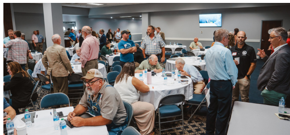
Illinois Basin RRT event in Western Kentucky