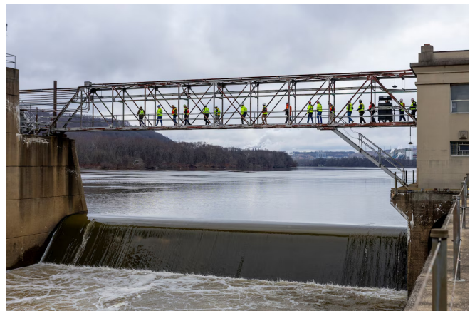
U.S. Army Corps of Engineers Pittsburgh District Project on the Ohio River. (Michel Sauret)

The Interagency Working Group on Coal and Power Plant Communities and Economic Revitalization (Energy Communities IWG) is tasked with convening relevant stakeholders in communities along the waterways. This collaborative approach aims to address these communities' unique challenges and unlock their economic potential through targeted support and strategic investments.