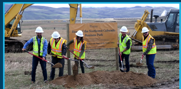
Routt County, Colorado