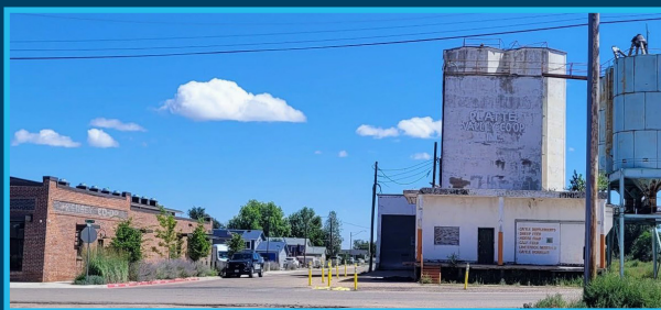
Weld County, Colorado