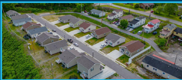
Perry County, Kentucky