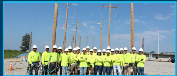
Hopkins County, Kentucky