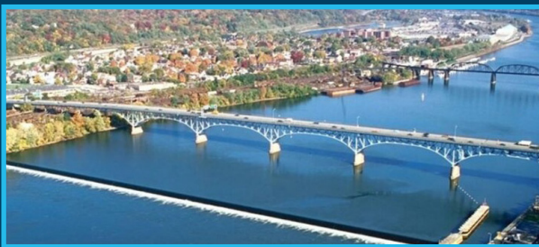
Allegheny County, Pennsylvania