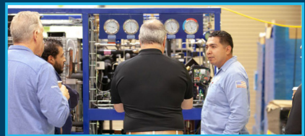
Butler County, Pennsylvania