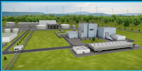
Lincoln County, WY